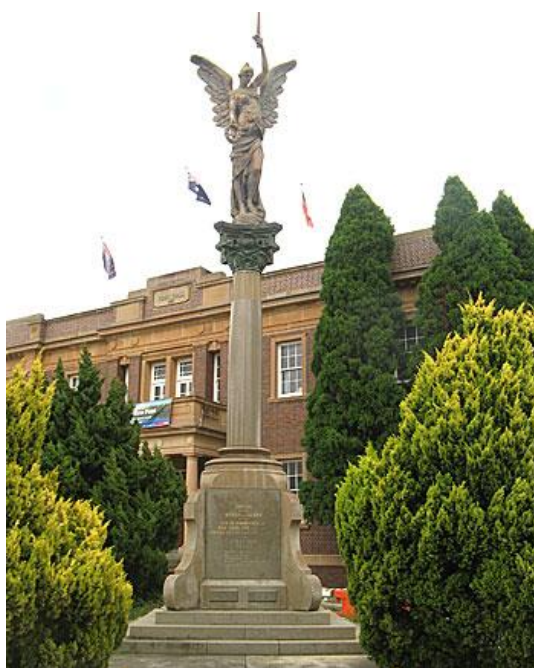
Marrickville War Memorial