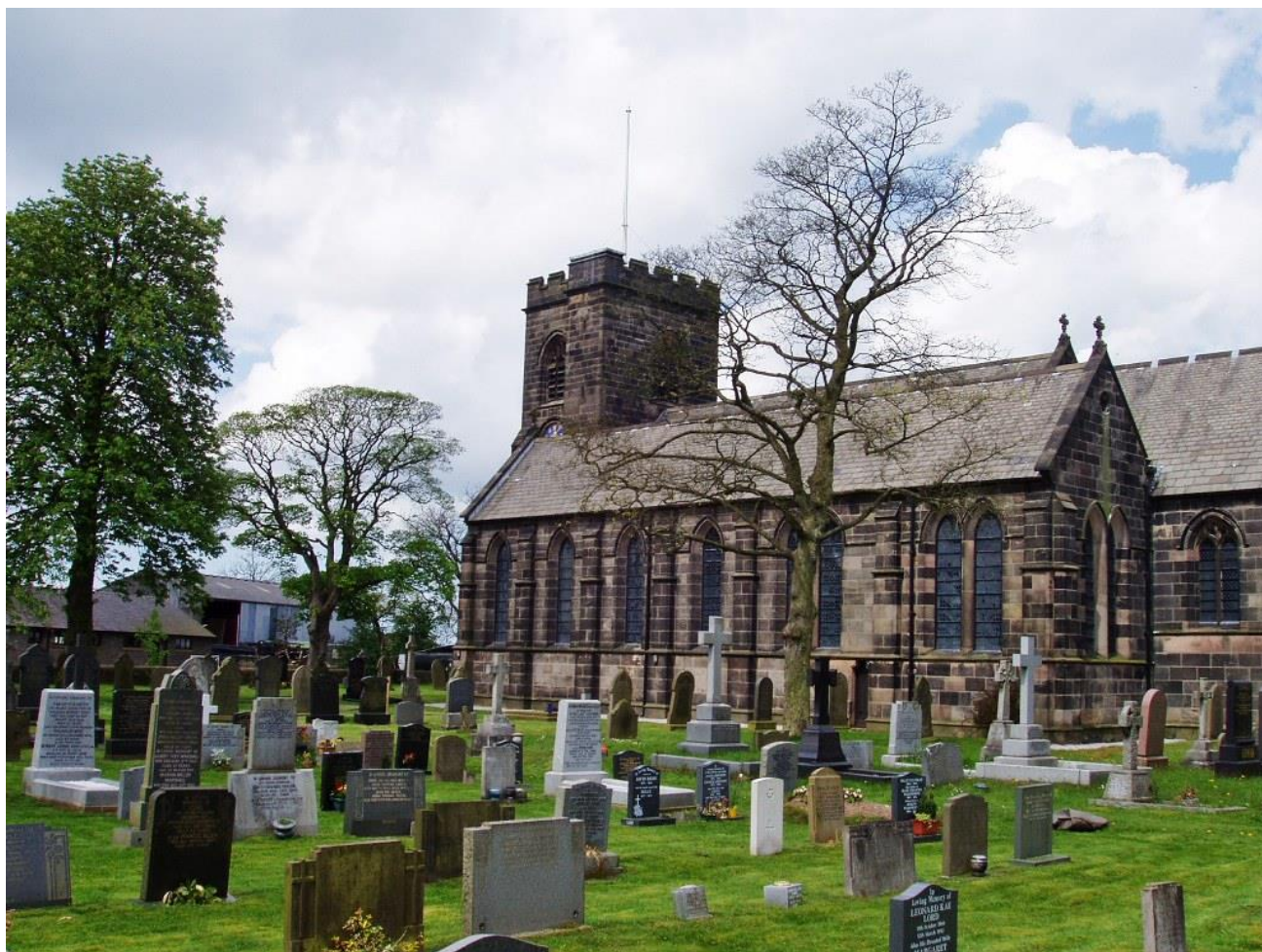
Holy Trinity Churchyard, Hoghton, Lancashire

Holy Trinity Churchyard, Hoghton contains 4 Commonwealth War Graves – 3 relating to World War 1 & 1 from World War 2.