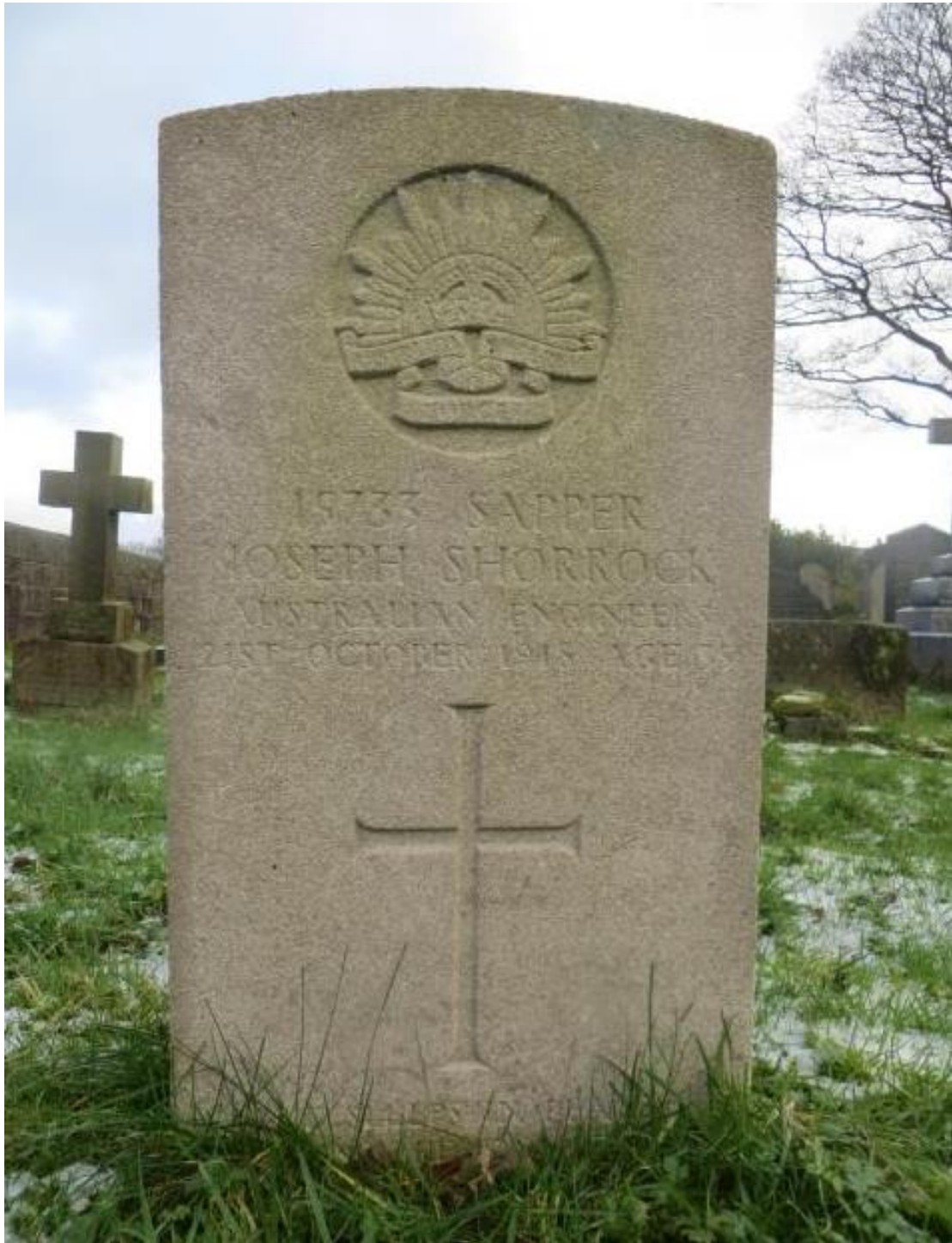
Photo of Sapper Joseph Shorrocks's Commonwealth War Graves Commission Headstone in Holy Trinity Churchyard, Houghton, Lancashire, England.